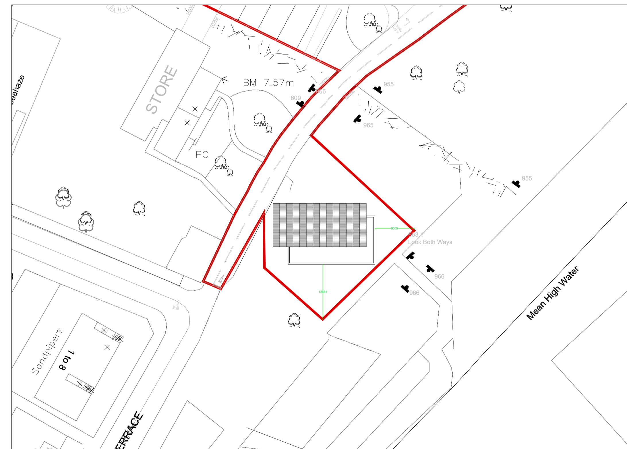
Proposed Block Plan - 1:500